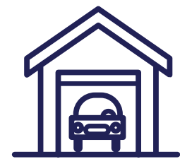
Work on Garages