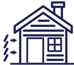
Removing or Replacing Siding