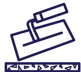
Concrete Work or Hard Landscaping

COA applications can be found online at www.southbendin.gov/hpc-coa .