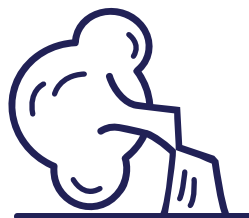
Removing a Mature Tree