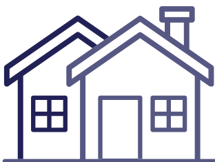
Additions or New Structures (Shed etc.)