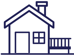
Adding or enclosing a Deck or Porch