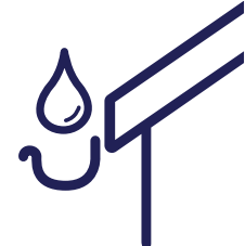
Work on Gutters Soffit or Fascia