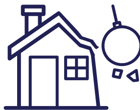
Demolition of Any Kind